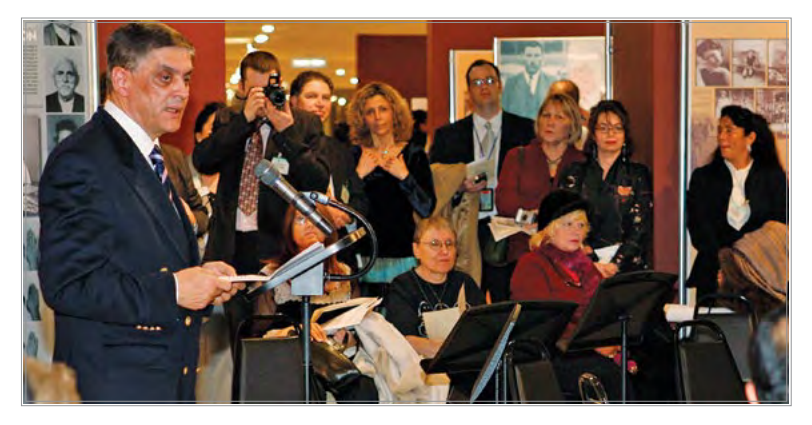
Romani Rose, Chairman of the Central Council of German Sinti and Roma, opens the exhibit titled "The Holocaust Against the Roma and Sinti and Present Day Racism in Europe", at United Nations Headquarters in New York on 30 January 2007.