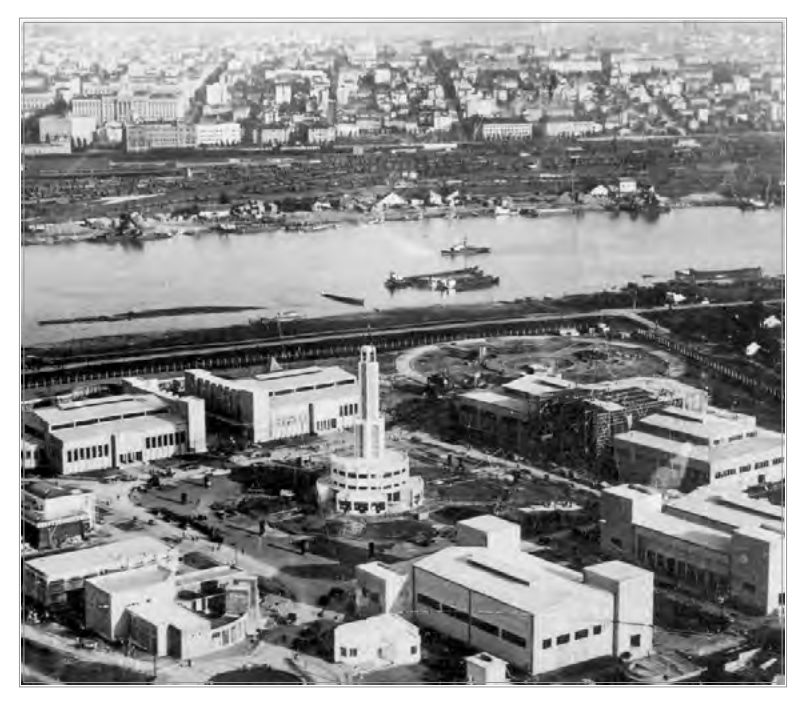
The Belgrade fairground in 1937.