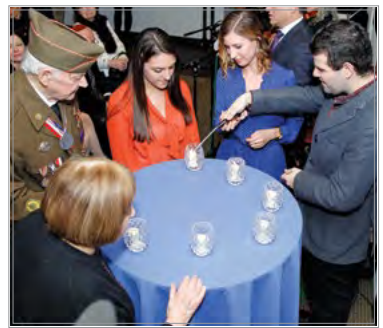
Veterans from the Second World War take part in the "When You Listen to a Witness, You Become a Witness" exhibit opening on 29 January 2014.