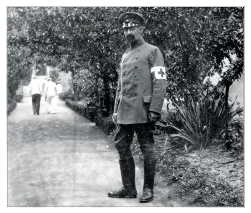
Rabbi Leo Baeck as a field chaplain during the First World War.