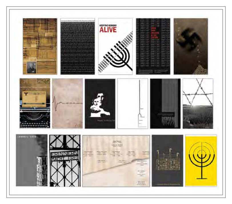
The "Keeping The Memory Alive" poster design competition was a joint project supported by the International Holocaust Remembrance Alliance in 2014.

In 2014, the Holocaust Programme partnered with the International Holocaust Remembrance Alliance, Yad Vashem, the Holocaust Martyrs' and Heroes' Remembrance Authority in Israel, the London Jewish Cultural Centre in the United Kingdom, and the European Shoah Legacy Institute in the Czech Republic, to organize the Keeping the Memory Alive poster competition. UNICs encouraged students from around the world to participate in the contest, and organized exhibitions of the top 16 entries to mark the 27 January International Day of Commemoration in memory of the victims of the Holocaust.