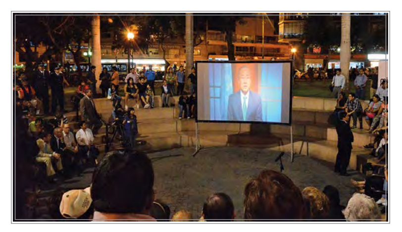
To mark the International Day of Commemoration in memory of the victims of the Holocaust, UNIC Lima and the Embassy of Israel, organized the screening of the Holocaust Programme's Tenth Anniversary Film in a public park in Lima, Peru.