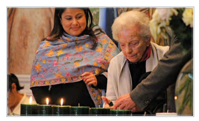
UNIC Bogota, along with the Jewish community, organized an exhibit to mark the International Day of Commemoration in memory of the victims of the Holocaust in 2015. Holocaust survivors light the traditional candles in memory of the victims