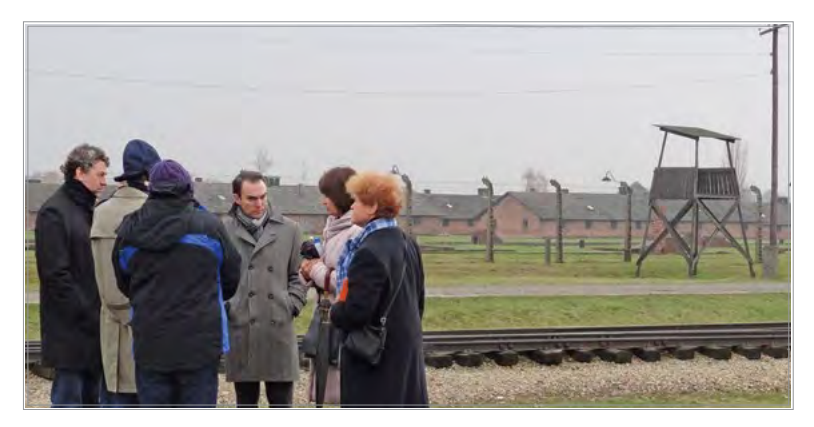
Participants in the Raphael Lemkin Seminar for Genocide Prevention, an IHRA-funded project, visit Auschwitz-Birkenau in November 2012.