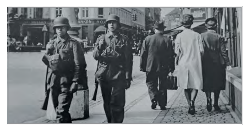
German soldiers walking on the Højbro Square in Copenhagen, Denmark, during the Second World War.