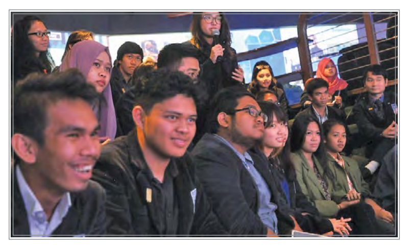
UNIC Jakarta, with the US Embassy in Indonesia, organized the United Nations first public Holocaust remembrance event in Indonesia to mark the International Day of Commemoration in memory of the victims of the Holocaust in 2015.

Holocaust Programme provides UNICs with educational materials used to reach people everywhere with the universal lessons of the Holocaust.