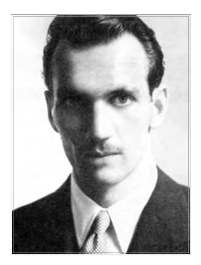
Jan Karski portrait, 1944.