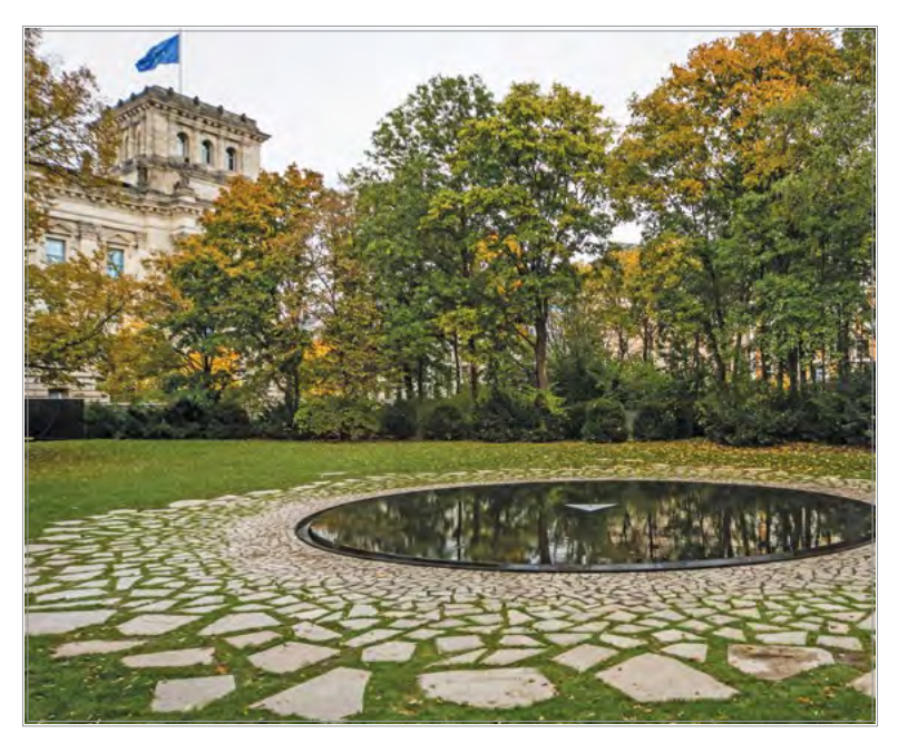
The Memorial to the Sinti and Roma Victims of National Socialism in Berlin, Germany.