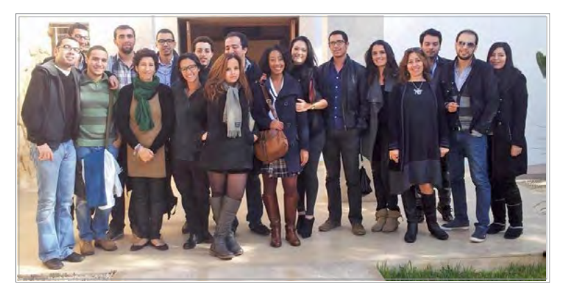
Association Mimouna general assembly held at the Moroccan Jewish Museum of Casablanca in 2013.