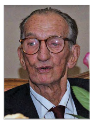
Karski at the Museum of the City of Lodz in his birthplace of Lodz, Poland in 1999.