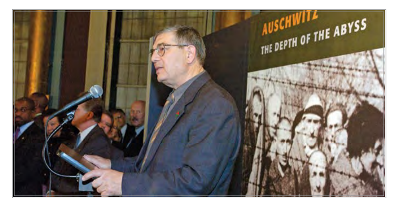
The exhibition titled "Auschwitz — the Depth of the Abyss" opened in the General Assembly Visitors' Lobby on 24 January 2005, three days before the official sixtieth anniversary of the liberation of the Nazi death camp in Europe. Avner Shalev, Chairman of the Yad Vashem Directorate, delivers opening remarks.