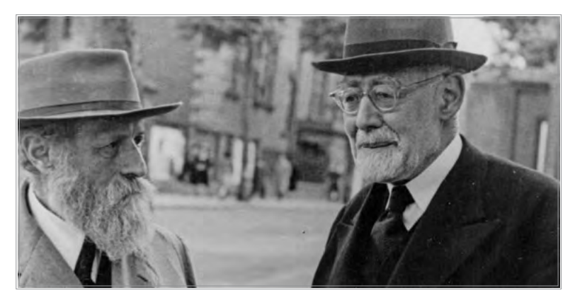
Rabbi Leo Baeck and Martin Buber in London, following the Second World War.