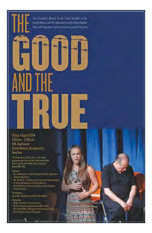
The Holocaust and the United Nations Outreach Programme in partnership with the Permanent Mission of the Czech Republic to the United Nations organized a special performance of the play "The Good and the True" in August 2014.

In January 2014, the Holocaust Programme organized the opening of the exhibition titled A Remembrance of the Holocaust in Hungary: 70th Anniversary Exhibition, in partnership with the Permanent Mission of Hungary to the United Nations, the Lantos Foundation for Human Rights and Justice, the Hungarian American Coalition, the Hungary Initiatives Foundation and the Carl Lutz Foundation. This exhibition presented an historical account of the Holocaust in Hungary in observance of the 70th anniversary of the deportation and extermination of the Hungarian Jews. In addition, in January 2014, veterans from the Second World War took part in the opening of When You Listen to a Witness, You become a Witness exhibit at United Nations Headquarters in New York. The