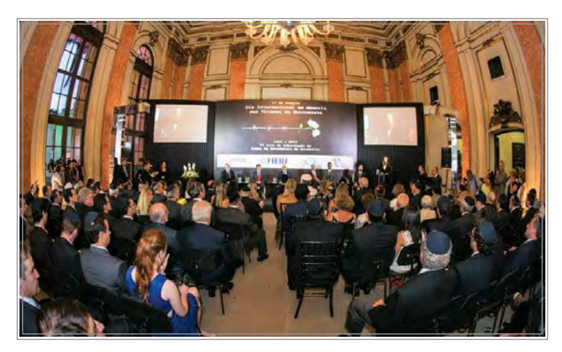
UNIC Rio de Janeiro organized a public event at the Itamaraty Palace in Brazil, on 27 January 2015 to mark International Day of Commemoration in memory of the victims of the Holocaust.