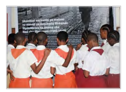
In Tanzania, students from nine secondary schools and three universities attended an event organized by UNIC Dar es Salaam to mark the International Day of Commemoration in memory of the victims of the Holocaust in 2015.