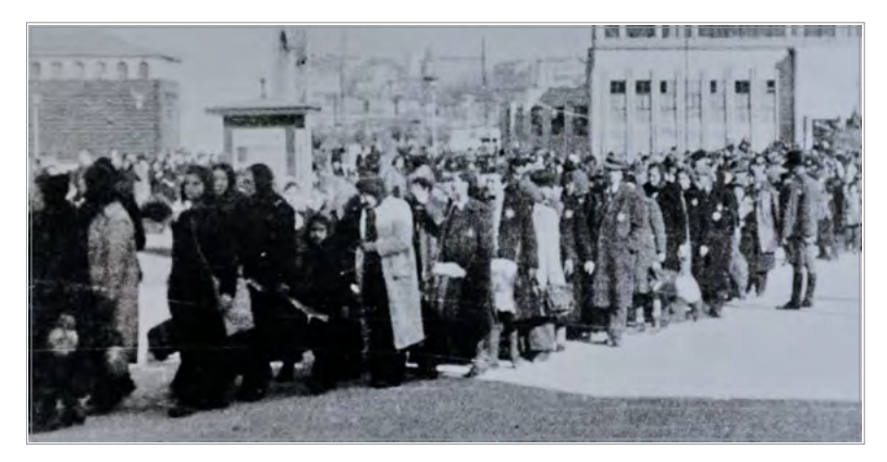
The arrival of Jewish inmates at the Semlin Judenlager on December 1941.