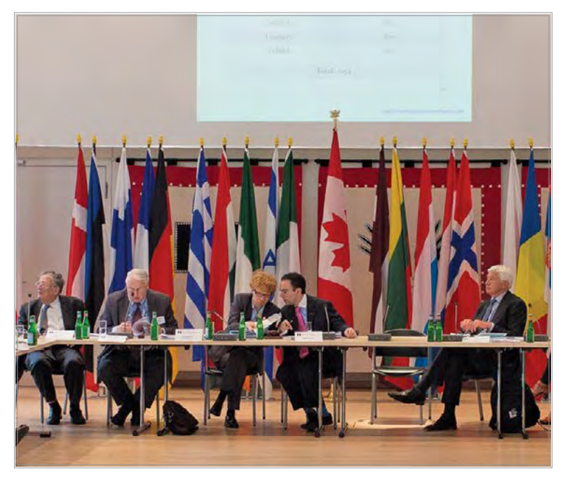
International Holocaust Remembrance Alliance plenary session held at the embassy of Canada in Berlin in 2012.